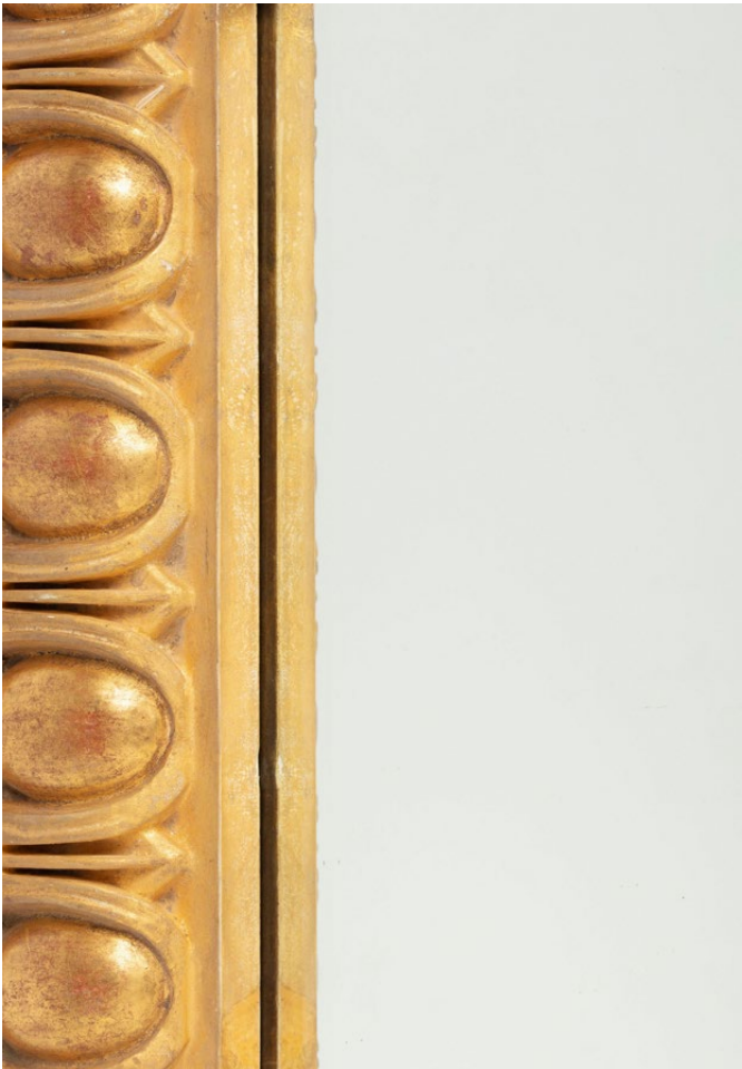
Plain Plate (PM)