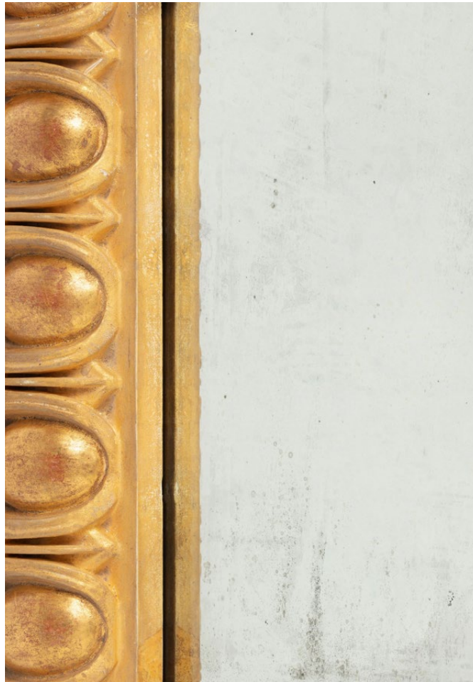
Mercury Plate (MP)